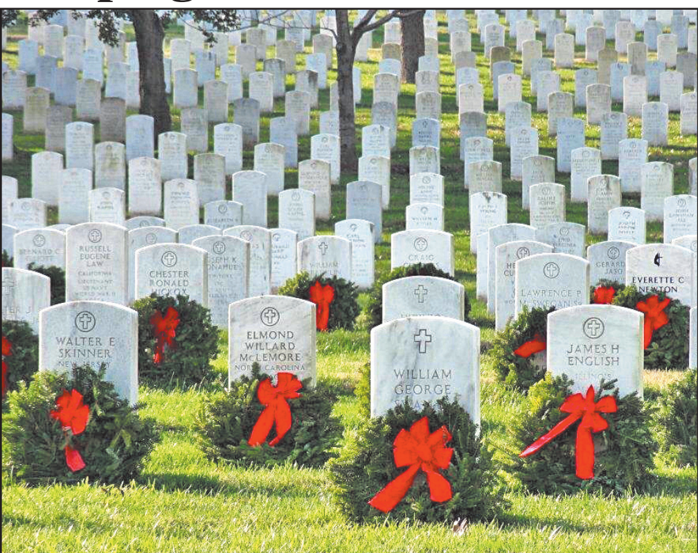
Wreaths placed in memory of American veterans. Pictured here, Arlington National Cemetery.